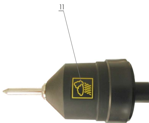
Contact electrode 420 kV